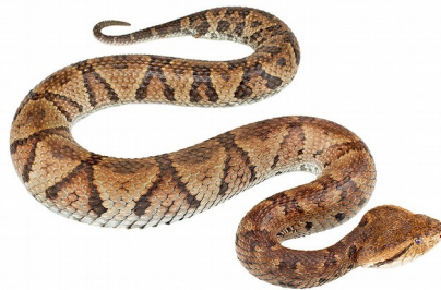
Small-eyed Toadhead (Hoja Podrida / Bothrocophias microphthalmus) - Another poisonous pit viper species