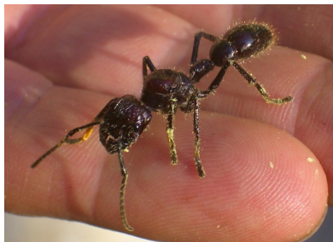
Bullet ant / Kong ant (Konga / paraponera clavata) - A large ant. 1-2 inches / 2-4cm long. The sting can cause "waves of burning, throbbing, all-consuming pain that continues unabated for up to 24 hours" Considered the most painful insect sting in the world. If you're lucky, they just nip you with a partial dose of venom.