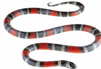
Ecuadorian Coralsnake (Coral ecuatoriana / Micrurus bocourti) - a venomous coral snake, of which several similar species exist here.