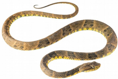
Common Lancehead (Equis amazonica / bothrops atrox) - venomous pit viper species