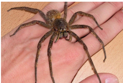
Brazilian Wandering Spider (Phoneutria fera) - A large spider with a particularly painful bite. Likes dark, dry areas (like right behind where you put your backpack on the floor.)